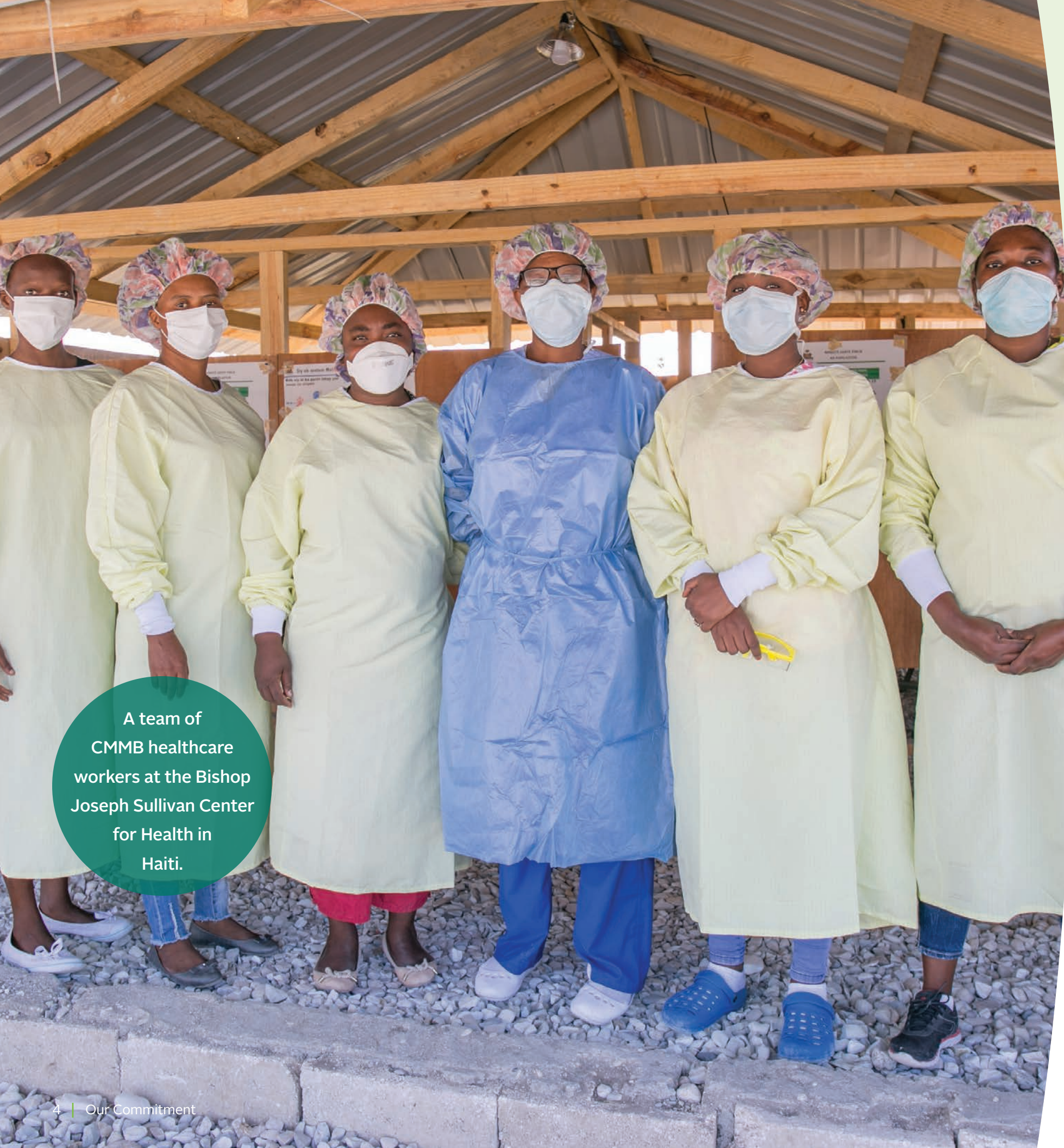
A team of CMMB healthcare workers at the Bishop Joseph Sullivan Center for Health in Haiti.